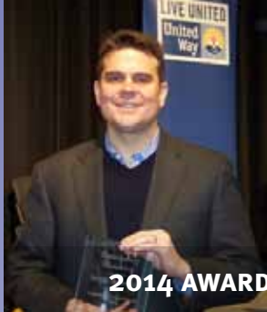
2014 AWARD RECIPIENTS