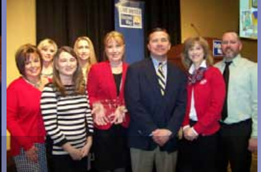
spirit of community